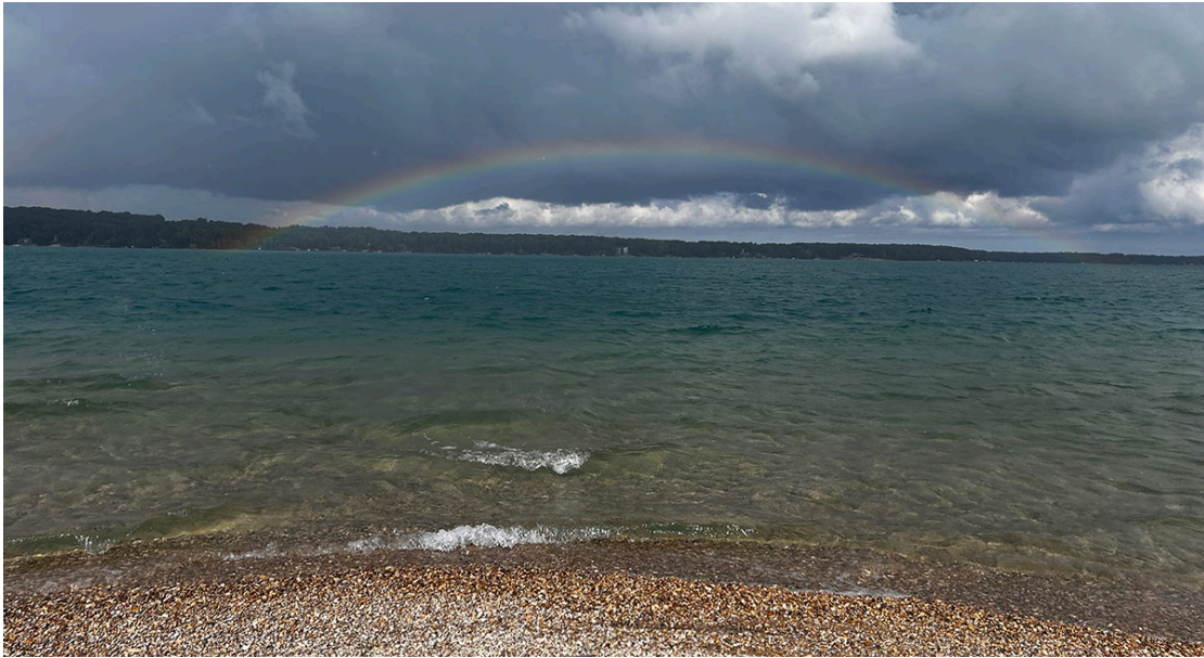
Rainbow surprise at the point – the blurred moments in time!