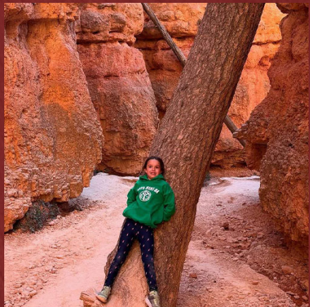
Penelope – Bryce Canyon, UT