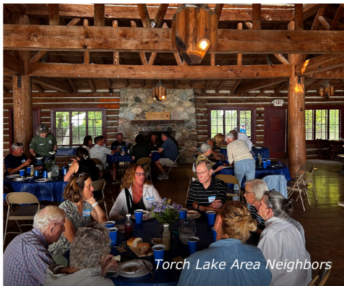
Torch Lake Area Neighbors