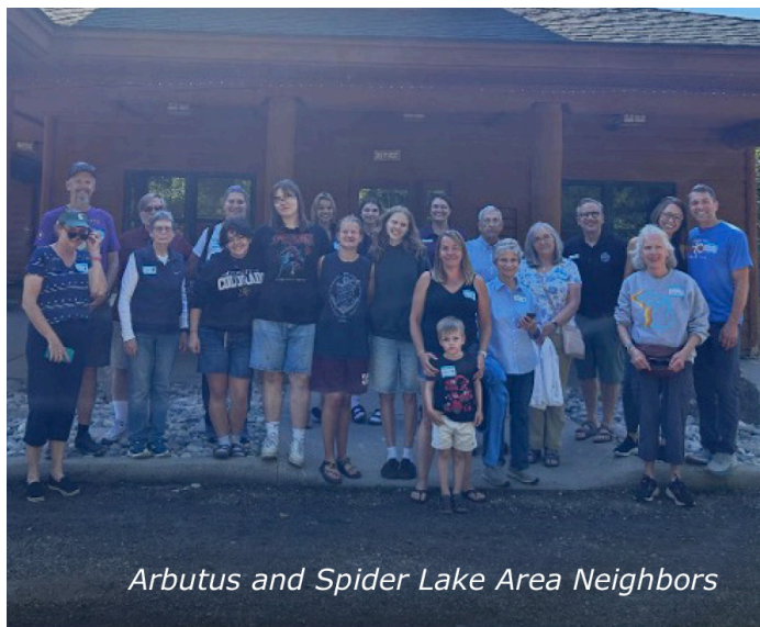
Arbutus and Spider Lake Area Neighbors

If you missed this year's gathering, we'd love to welcome you next time. There's always room at the campfire.