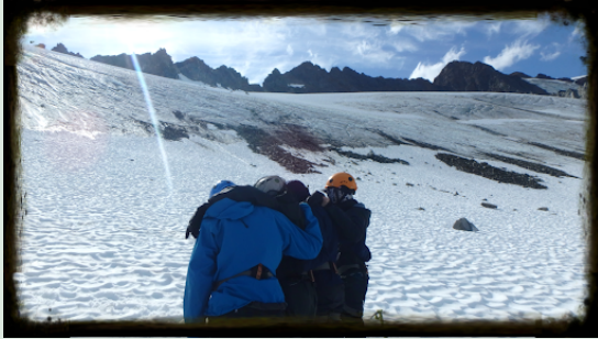
Singing & supporting one another while Ice Climbing