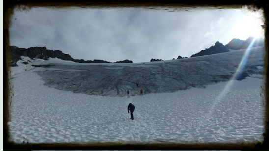
Ice Climbing on Flower Mountain

The adventures, scenery, and laughter from three weeks in Alaska is something I will cherish forever. It was amazing to see what can be accomplished through a willingness to try new things, a group-focused mindset, and a positive attitude. I am thankful to AHWH for giving me the opportunity and I am excited for groups who will go in the future!