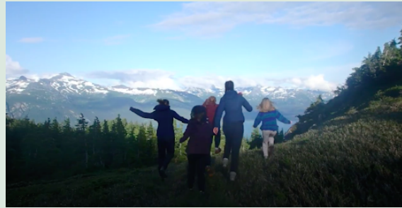
Photo on right: Backpacking portion of the trip on the side of Mt. Ripinski.

Rainbow sunsets on top of snowy mountain peaks. Card games on rocky beaches, laughter echoing through the cove. Ice climbing on a glacier, singing to keep our hearts full and bodies warm. Snacking on fresh Salmon Berries along the trail. Waking up to the sound of the ocean and the brisk, pristine air. Encouraging each other up steep passages. Frolicking through forests, mountains, beaches, and meadows in the Last Frontier. These are the scenes that flood my memory when I think of adventures in Alaska this past summer.